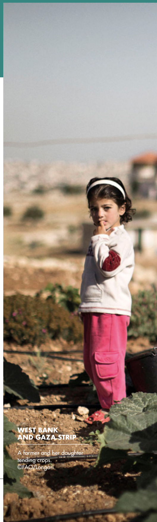
WEST BANK AND GAZA STRIP

Cover photo: Burundi – Refugees fleeing civil conflict.