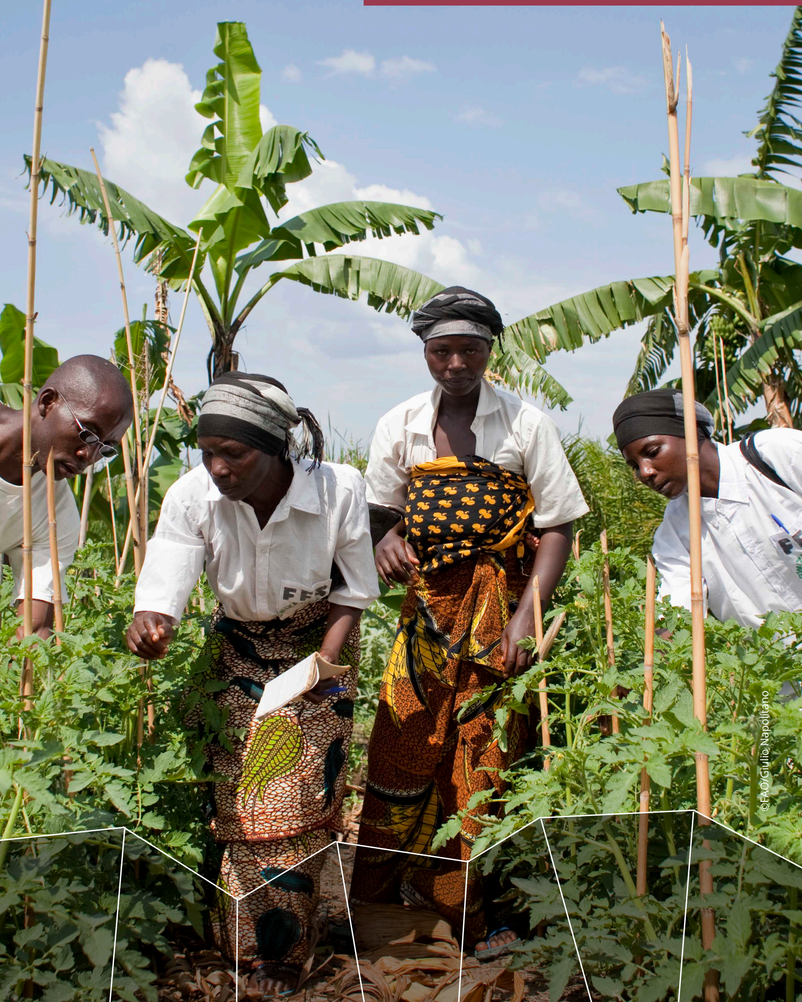
Burundi: Women from Mutambara I “Village de la paix” working on a tomato crop during their training activities.