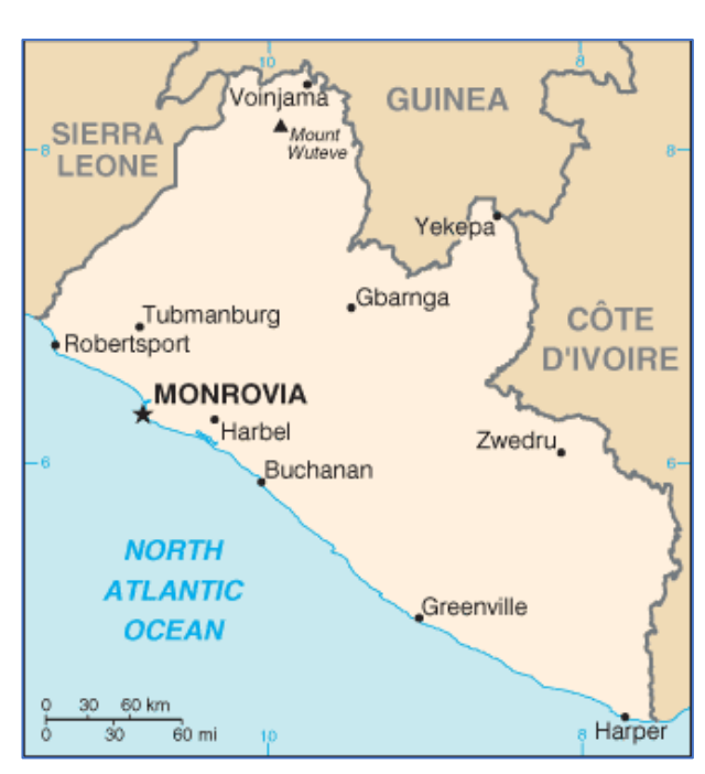
Figure 2. Map of Liberia

Three major events over the past three decades profoundly impacted Liberia's development: the civil war, the election of President Johnson-Sirleaf and the Ebola virus disease. The brutal civil wars from 1989 to 2003 virtually destroyed all of Liberia's infrastructure and systems. A reported quarter of a million people were killed with many more suffering (Cutler, 2011). A Peace Agreement was finally signed in 2003 with the promise of a two-year transitional government in preparation for elections in 2005. The first woman president of an African nation, Ellen Johnson Sirleaf, was elected in 2005 and began the difficult process of rebuilding. She ushered in Liberia's first Poverty Reduction Strategy, which recognized agriculture as a major driver advancing the aim of rapid, inclusive, sustainable growth and development (International Monetary Fund [IMF], 2008). From a very low starting point, Liberia's economy began experiencing important improvements. President Sirleaf was re-elected in 2011; the peace held; and strides forward were