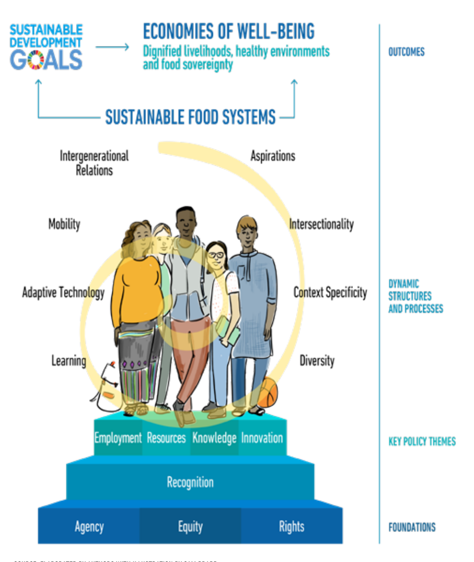
FIGURE 2 CONCEPTUAL FRAMEWORK TO FULLY ENGAGE YOUTH IN FOOD SYSTEMS

SOURCE: ELABORATED BY AUTHORS WITH ILLUSTRATION BY SAM BRADD.