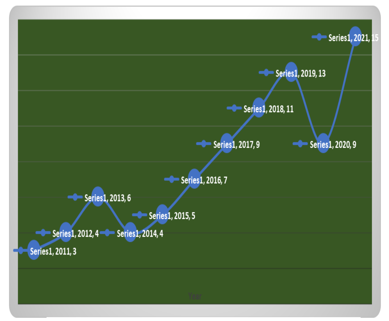
Figure 2: Article distribution across years

As earlier stated, this review had a set boundary of 2011 till 2021. Entries in Figure 2 show that there is an emerging dynamism in researches relating to digitalization of agriculture in Nigeria. While 3.40% of the articles were published in 2011, 17.44% were published in 2021. Apart from 2020, the number of published articles maintained an ascending order from 2014 -2021 with 66.28% of the articles published within this period. Given the low level of internet use among researchers in developing countries, the decrease in the number of articles published in 2020 may be attributed to the out-break of the Covid-19 pandemic which necessitated such policies as lockdown and restriction of movement.