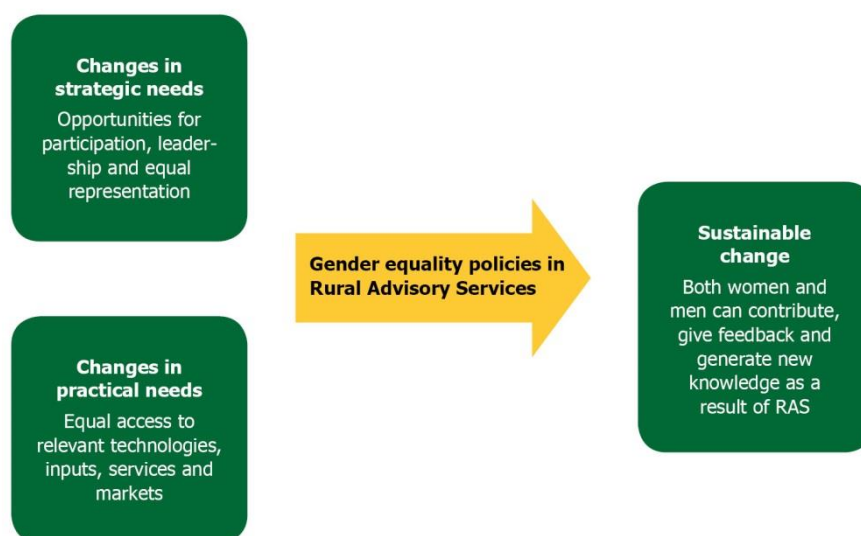
Figure 2. Route to sustainable change in gender equality

Many interventions in RAS have targeted women’s specific practical needs for a specific period of time and have resulted in practical benefits for women in that period. However, looking beyond these interventions, it is striking that a major issue constraining gender equality in agriculture is the lack of sustainability when it comes to up-scaling/mainstreaming the concept of gender equality beyond the specific project interventions. The present paper seeks to provide insights and advice for policy makers and extension organisations that go beyond specific gender project interventions and pursues sustainable changes in the policies, regulatory framework, organisational structures and practises that can effectively support empowerment and equal opportunities for rural women. As figure 2 illustrates, this cannot be achieved only through changes in practical needs for the rural women but requires structural changes in attitudes and power relations in the whole organisational setup that will change women’s by ability to participate in setting the agenda and making decisions for the rural advisory services that will contribute to ensure its relevance to both women and men.