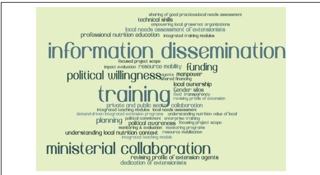
Figure 1. Challenges in integrating nutrition into EAS by online survey respondents. The figure represents a word cloud of the most frequently mentioned keywords by respondents to the online survey question “What would be considered the greatest challenges in integrating nutrition into EAS.” The font size of the words that are placed into the wordcloud represent frequency and usefulness. The more prominent (larger text size) the word is in the word cloud, the more frequently it appeared in the online provided. Transportation, task overload, funding, and quality training were considered the most frequent challenges listed in the survey responses.

The challenges stemming from the online surveys and interviews could be characterized into four major challenges for the individual EAS agent and three broader systemic challenges: