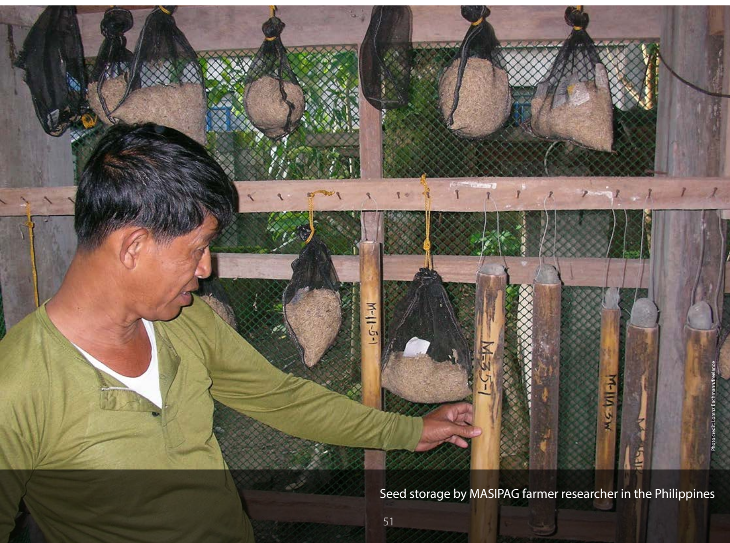
Seed storage by MASIPAG farmer researcher in the Philippines

Follow-up studies should include a closer look at the 30 cases from the “long list” (Annex F) that were excluded from this analysis because documented impact data were lacking. Several of these cases may yield important information and lessons related to the key areas and questions mentioned above — and also about the actual and potential role of formal researchers in strengthening farmer-led research and development processes.