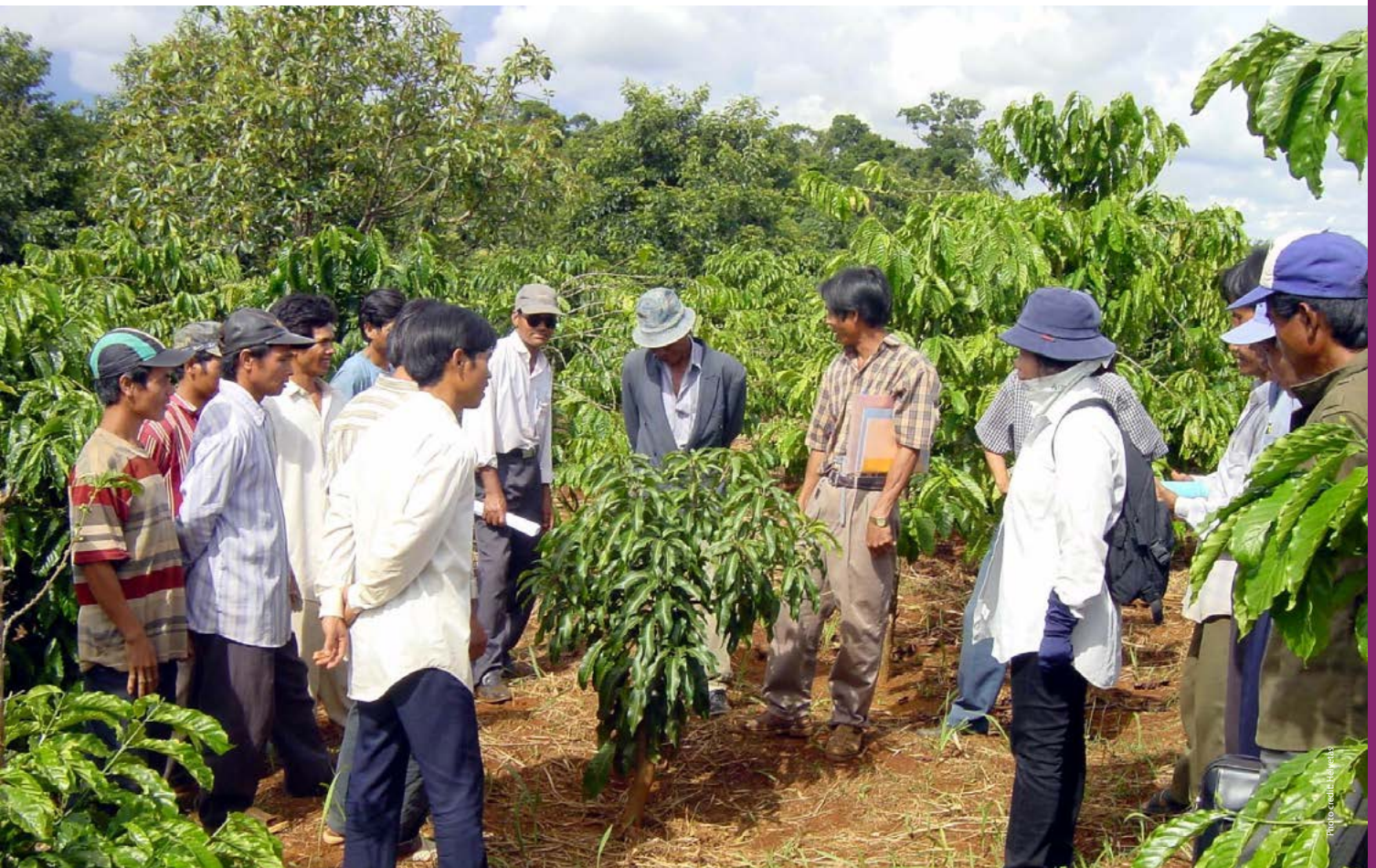
Farmers discuss PTG experiment in Dak Tih Commune, Dak Nong Province, Vietnam

In line with this, the Feldafing Principles for Enhancing Agricultural Innovation Systems (GIZ–CGIAR 2014) refer to the need for a long-term perspective to allow innovation dynamics to develop.